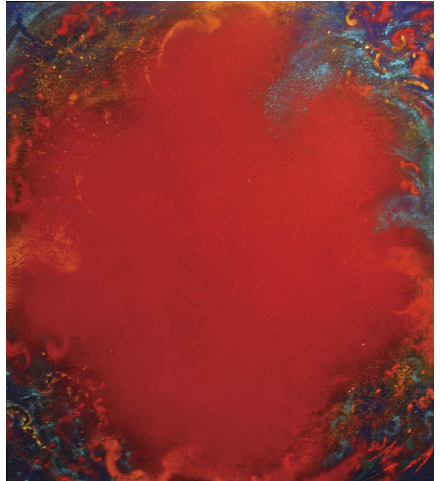
Natvar Bhavsar, VASOO III , 1997, Pure pigment on canvas, 62.5 x 56 in.